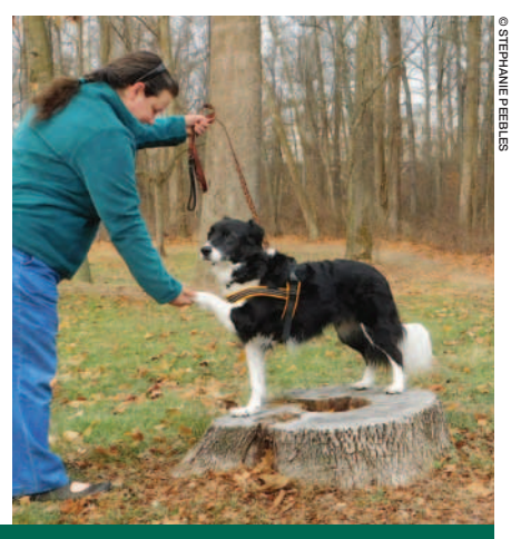
Tessa crouches to "Go Under," powers forward with her rear legs as she performs the "Jump Assisted," and balances on the stump as she completes a "Trick on a Platform."

My dog and I usually do a fair amount of hiking around, looking for different environmental features to use for parkour, which also provides excellent exercise and conditioning for my agility partner.