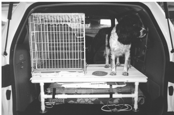
Figure 3 (The black matting is not shown in this photo.)