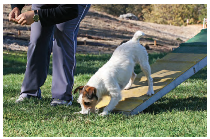
A nose touch should be done between the dog's front paws.

If I am training two-on/two-off contacts for all three contact obstacles, I teach the motion part of the teeter at the same time I teach the two-on/two-off position on a board. I do include a nose touch with the initial training of two-on/two-off. (Nose touches are always done between the front paws.) In training I support the nose touch as a secondary behavior to two-on/two-off to reinforce the dog's head remaining straight and low. Without the nose touch there is a tendency to reinforce the dog's looking at the handler, which can lead to the dog turning and exiting the board sideways. I do not ask for a nose touch in competition. I then backchain the dogwalk to completion before I start the dog on the A-frame. This keeps the amount of repetitive A-frame training to a minimum. The teeter training may be completed around the same time as the dogwalk as long as I don't encounter any evidence of fear of the moving board.