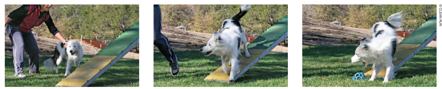
The Bounce into Position game encourages the dog to drive into the two-on/two-off position with speed. Here the dog is rewarded by throwing the toy to her while she's still on the board.

When asking for the bounce into position, I make certain that I myself am not moving when I say Touch, thereby insuring that the dog's response is on my verbal cue and not linked to my body motion.