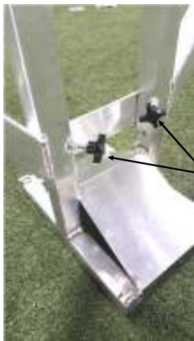
Height Adjustment Knobs

Slide the lower leg over the standing tubes of the upper leg as shown. Make sure the color dots are matched together. (blue to blue and red to red)