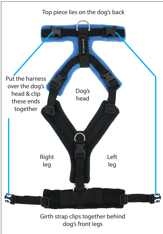
Put the harness on the dog and clip together.