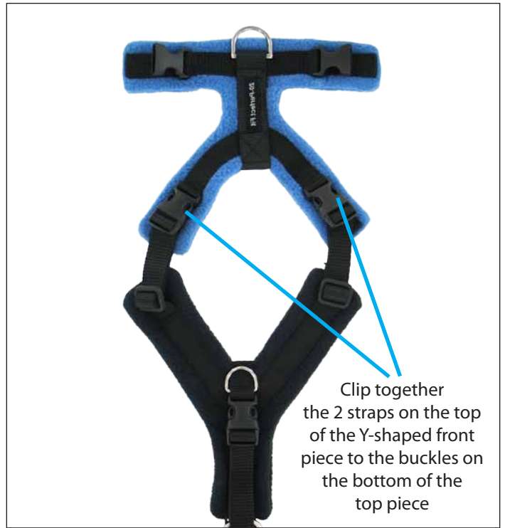
Connect the front piece of the top piece.