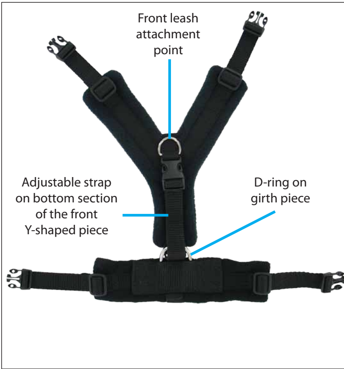
Connect the girth piece to the front piece.